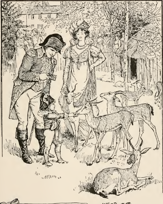
FEEDING THE GAZELLES WITH TOBACCO